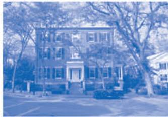
Two nights stay at Jared Coffin House