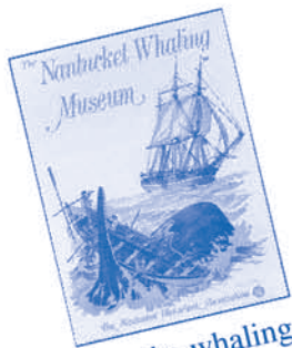
Tickets to the whaling museum