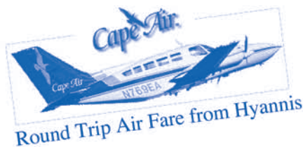
Round Trip Air Fare from Hyannis