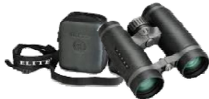
Elite 10x43 binoculars by Bushnell Donated by Bird Watchers General Store Orleans

"Take time to marvel at the wonders of life " Anonymous